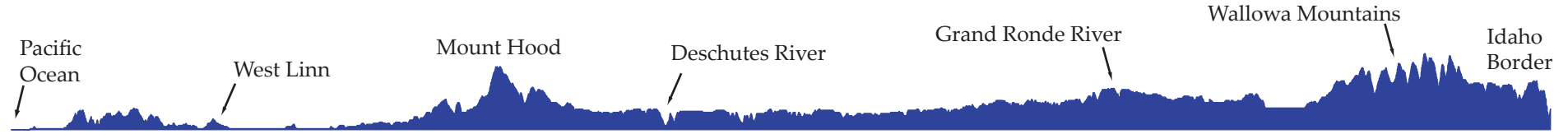
West to East (Northern Oregon)

These cross sections show differences in elevation in Oregon. For example, if you follow the blue line (Northern Oregon) from the west to the east you can see that the elevation is at sea level at the Pacific Coast, but is high at Mt. Hood and the Wallowa Mountains.