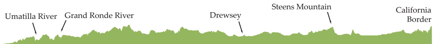
North to South (Eastern Oregon)

Because elevation changes are small compared to the horizontal distances, we have exaggerated the vertical scale (height) to better show the variation in the elevations.