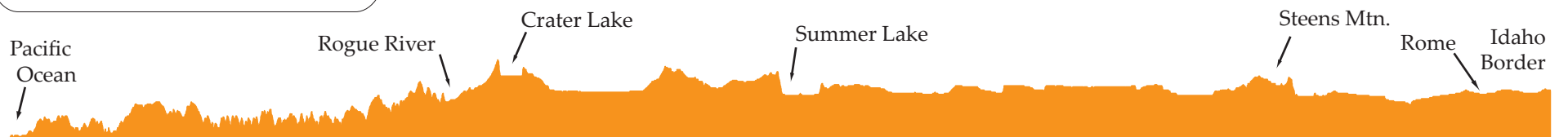
West to East (Southern Oregon)